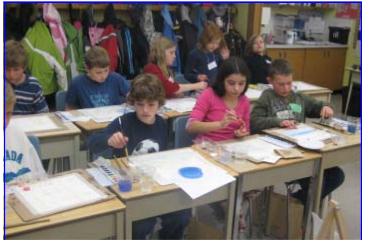
Budding Wallace Artists