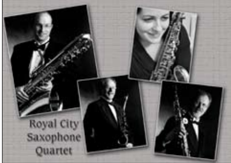
Royal City Saxophone Quartet