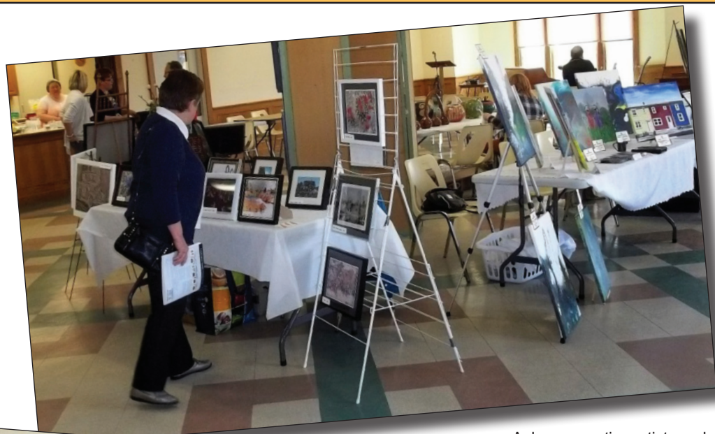
A dozen creative artists and musicians took part in the SpringWorks Festival Arts Showcase.

To keep better informed of the events of the North Perth Arts Council, bookmark our website www.NorthPerthArts.ca , become a creative or general member of our not for profit arts organization, or like us, follow us on Facebook group North Perth Arts and Culture Council.