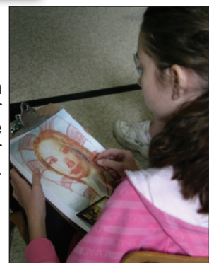
A student from the 2013 Summer Art Experience explores her creativity.