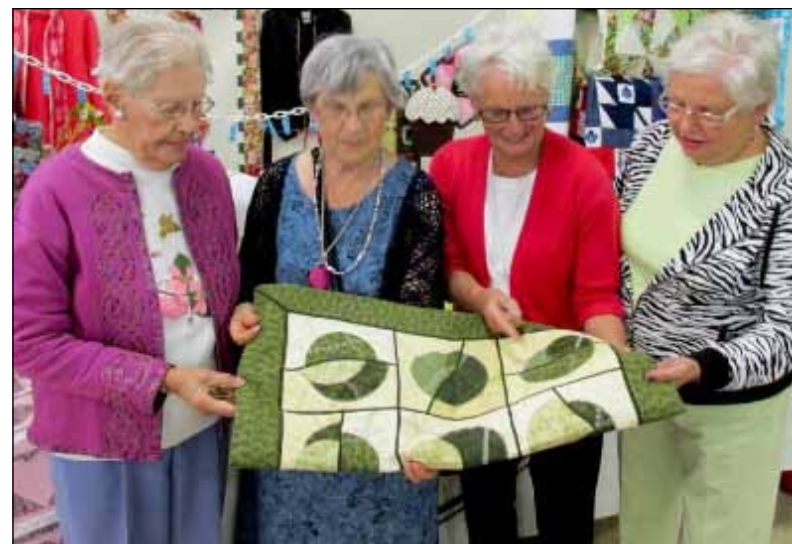
Creative Stitchery Display

tunity for a wide variety of local artists to show their work, to interact with each other and to learn from each other. The North Perth community can be proud of the