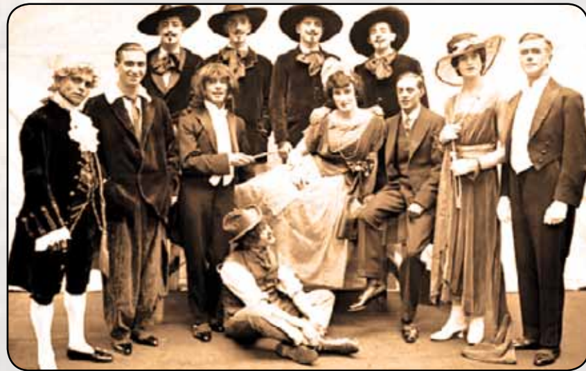
Original members of the Dumbells