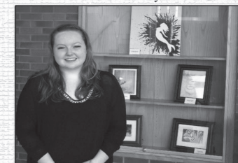
June - Ally Dunphy