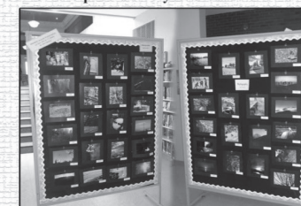
December - Annual Photography Show

Each month, NPACC features a local artist's work at the Listowel Library. This is another example of NPACC collaborating with an organization in North Perth to bring arts and culture to the forefront. If you have interest in being featured, contact NPACC by emailing info@northpertharts.ca .