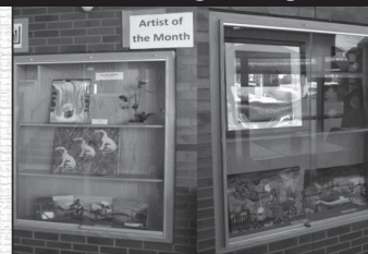
February - LDSS Art Students