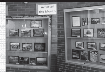
March - Maitland Valley Camera Club